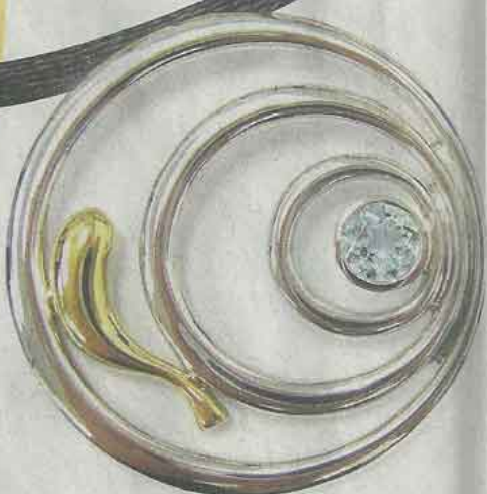
Ripple di Tranquillita